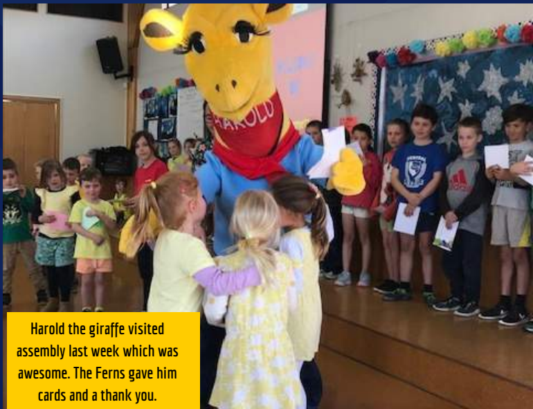
Harold the giraffe visited assembly last week which was awesome. The Ferns gave him cards and a thank you.