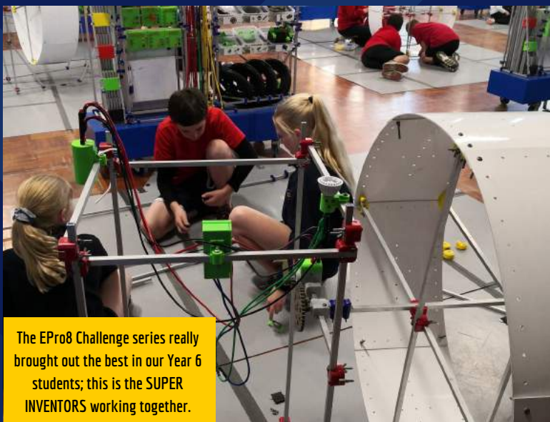
The EPro8 Challenge series really brought out the best in our Year 6 students; this is the SUPER INVENTORS working together.