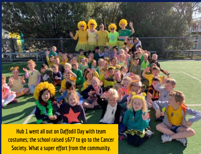
Hub 1 went all out on Daffodil Day with team costumes; the school raised $677 to go to the Cancer Society. What a super effort from the community.