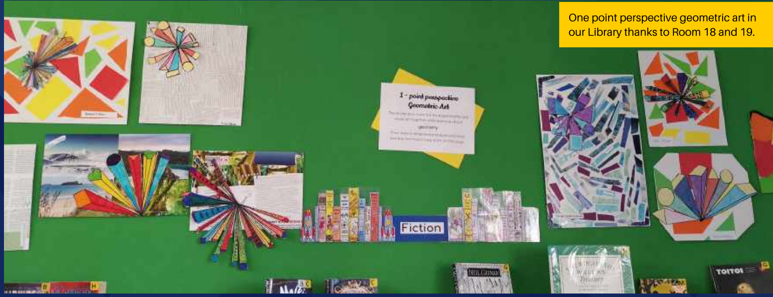
One point perspective geometric art in our Library thanks to Room 18 and 19.