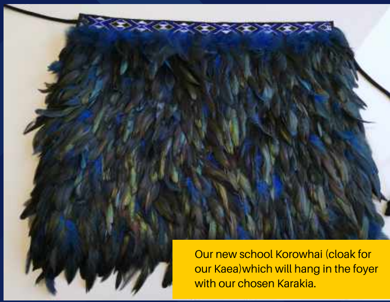
Our new school Korowhai (cloak for our Kaea) which will hang in the foyer with our chosen Karakia.

Contacts Us; Email: office@witherlea.school.nz Tel: (03) 578 5568 Fax: (03) 578 0799