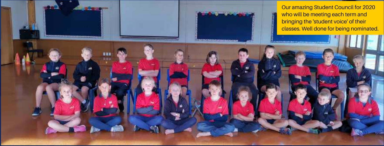
Our amazing Student Council for 2020 who will be meeting each term and bringing the 'student voice' of their classes. Well done for being nominated.