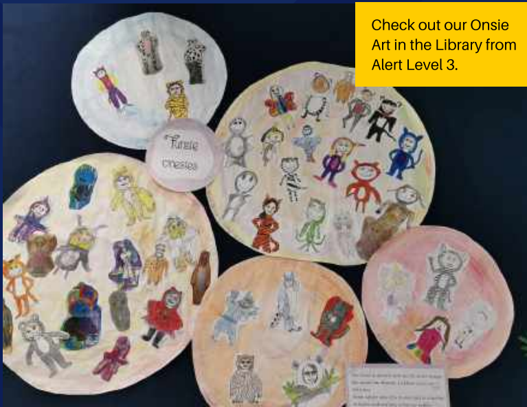
Check out our Onsie Art in the Library from Alert Level 3.