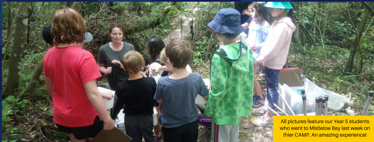
All pictures feature our Year 5 students who went to Mistletoe Bay last week on their CAMP. An amazing experience!