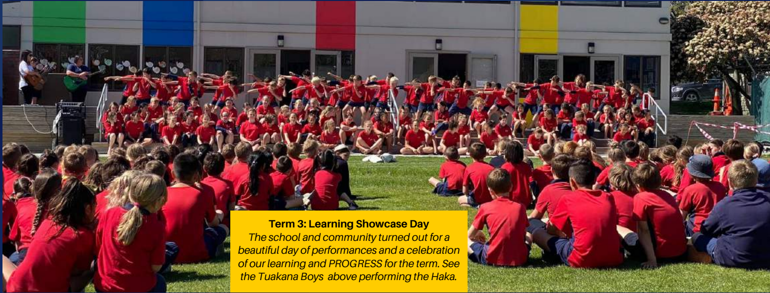
Term 3: Learning Showcase Day The school and community turned out for a beautiful day of performances and a celebration of our learning and PROGRESS for the term. See the Tuakana Boys above performing the Haka.