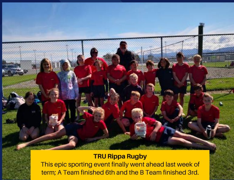
TRU Rippa Rugby This epic sporting event finally went ahead last week of term; A Team finished 6th and the B Team finished 3rd.

Contacts Us; Email: office@witherlea.school.nz Tel: (03) 578 5568 Fax: (03) 578 0799