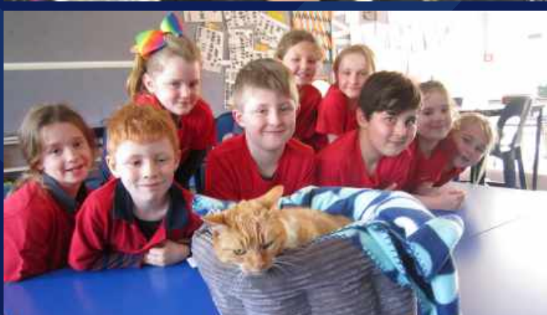
Thank you to the wonderful whanau who kindly came and fed our school cat 'Scuttles' over the holidays. She was so pleased to see the smiling caring children. Scuttles is pleased to be back inside and seeing all her school friends, and hearing about everyone's holiday.

WITHERLEA SCHOOL PARENT COMMUNITY GROUP Meeting 7.30pm 28 July 2020 - Witherlea School Staffroom ALL WELCOME!