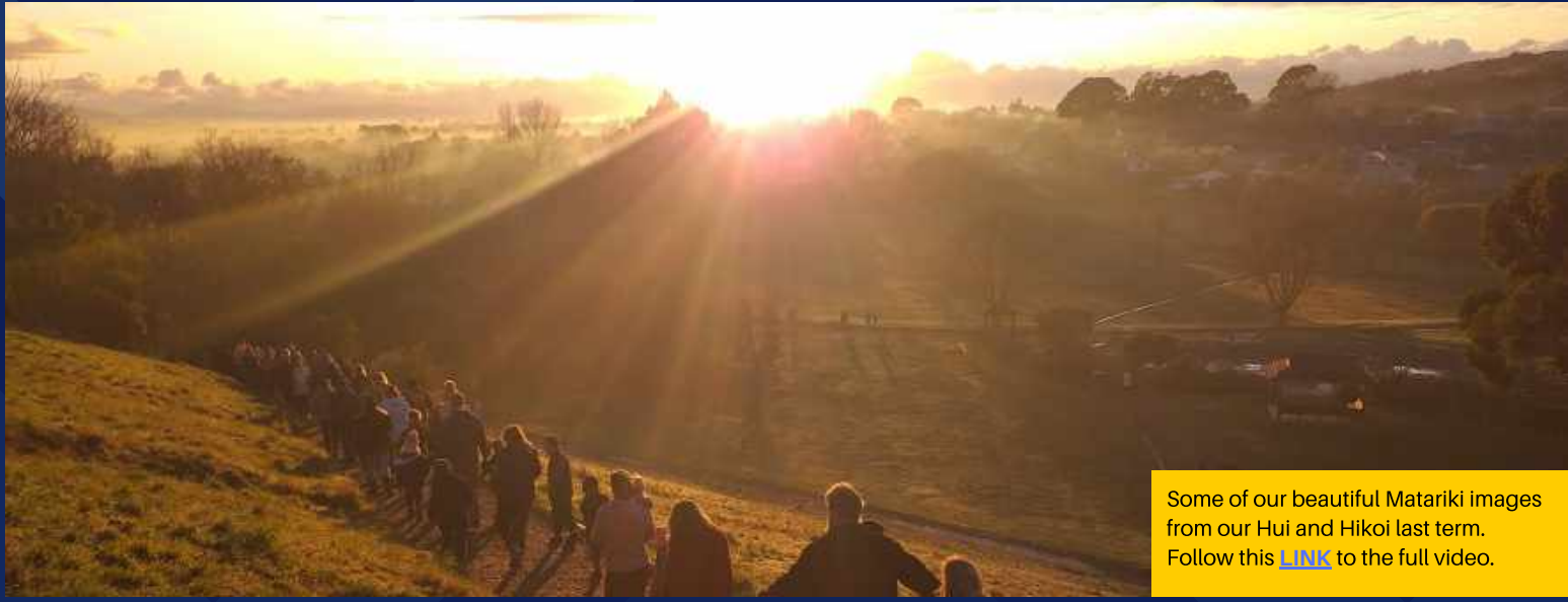
Some of our beautiful Matariki images from our Hui and Hikoï last term. Follow this LINK to the full video.