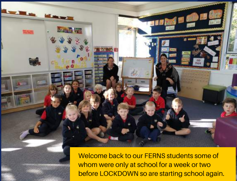
Welcome back to our FERNS students some of whom were only at school for a week or two before LOCKDOWN so are starting school again.