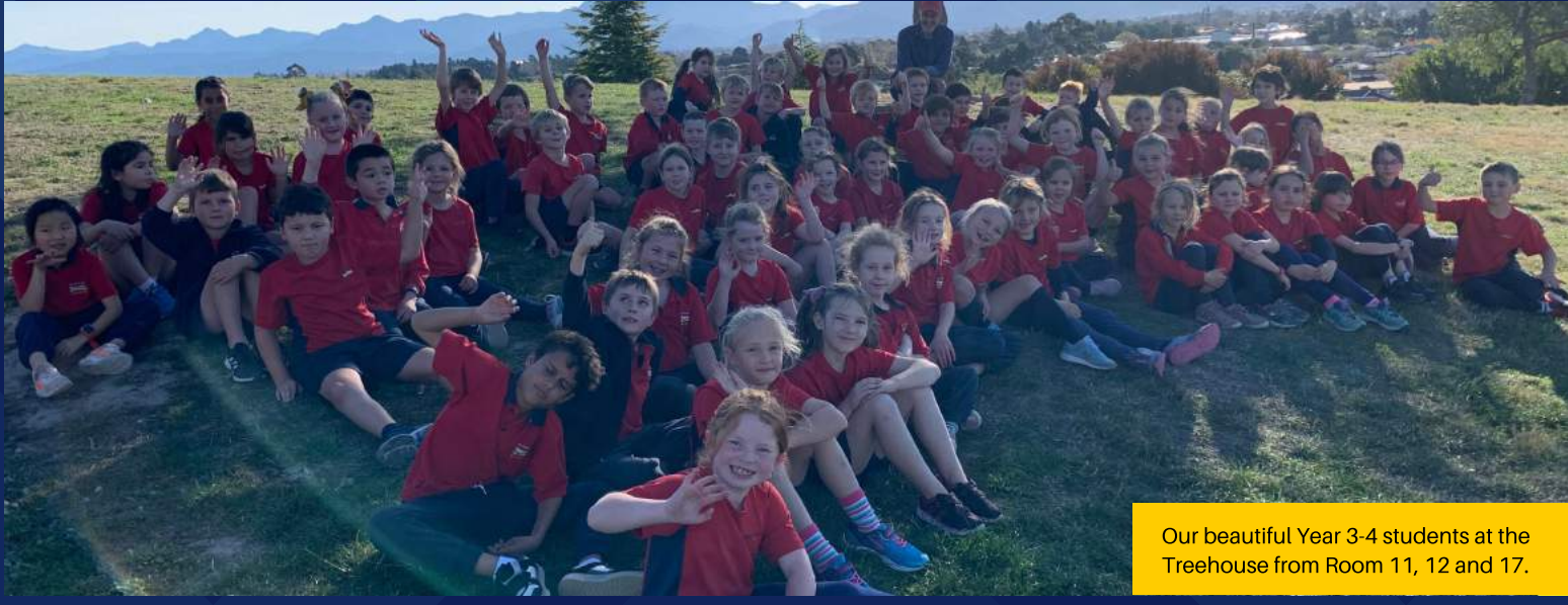
Our beautiful Year 3-4 students at the Treehouse from Room 11, 12 and 17.