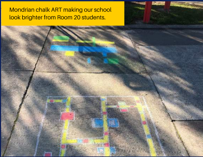
Mondrian chalk ART making our school look brighter from Room 20 students.