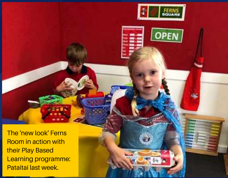
The 'new look' Ferns Room in action with their Play Based Learning programme: Pataitai last week.